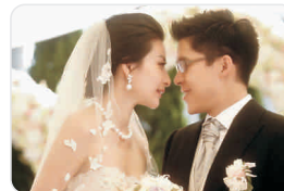
Live Wedding Broadcasting