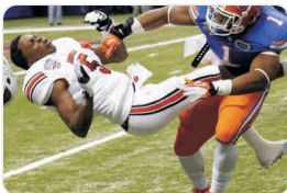
Live Sports Events