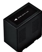
CGA-D54/CGA-D54s Battery Pack (5400 mAh)