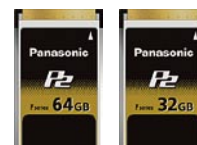
AJ-P2E064FG AJ-P2E032FG Memory Card "P2 card" F Series