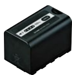
VW-VBD58 Battery Pack (5800 mAh)