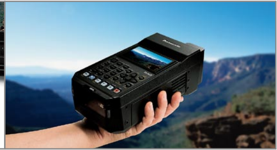
A handy sized unit with wireless LAN compatibility for diverse field uses.

The AJ-PG50 Memory Card Recorder supports the AVC-ULTRA codec family, featuring the AVC-Intra200 codec, which rivals the outstanding quality of uncompressed images, the AVC-LongG codec, which lets you choose from a variety of bit rates, and AVC-Proxy for high-quality proxy video. It is compact and lightweight, equipped with microP2 and P2 card slots, operates on a battery pack, and comes with a high-resolution QHD LCD monitor.