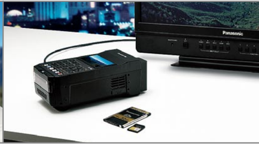
For monitoring, previewing, file copying and other applications.