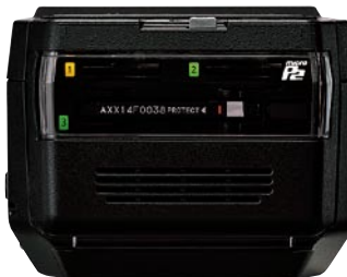
Front: Card slot and Speaker