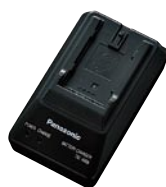
AG-B23 Battery Charger