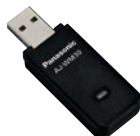
AJ-WM30 Wireless Module