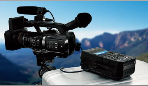
Backup recording with 3G-SDI or HDMI input from a camera.