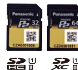
AJ-P2M064AG AJ-P2M032AG microP2 Card