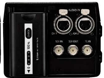
Rear: Battery and Terminal